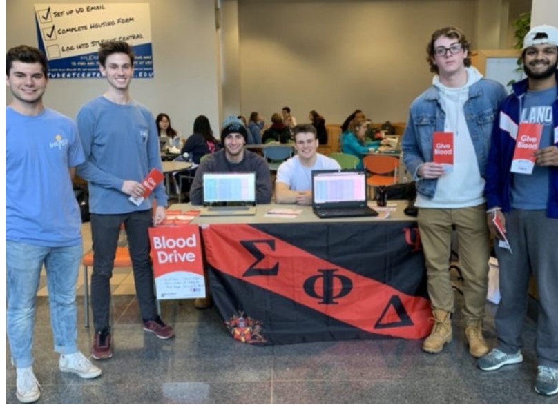
Psi Chapter blood drive