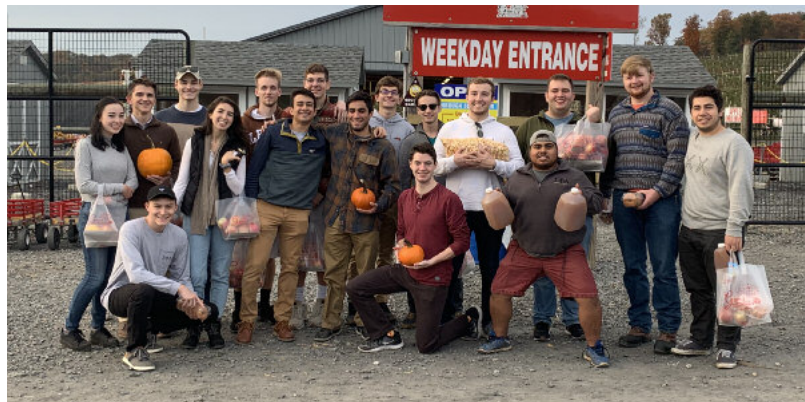
Beta-Kappa Apple Picking

In addition to social and brotherhood events, Fall 2019 also included plenty of professional and philanthropic work. Several Brothers began or continued their involvement with Lehigh's Global Citizen Program, Baker Institute, and Global Social Impact Fellowship, and two members were induct-