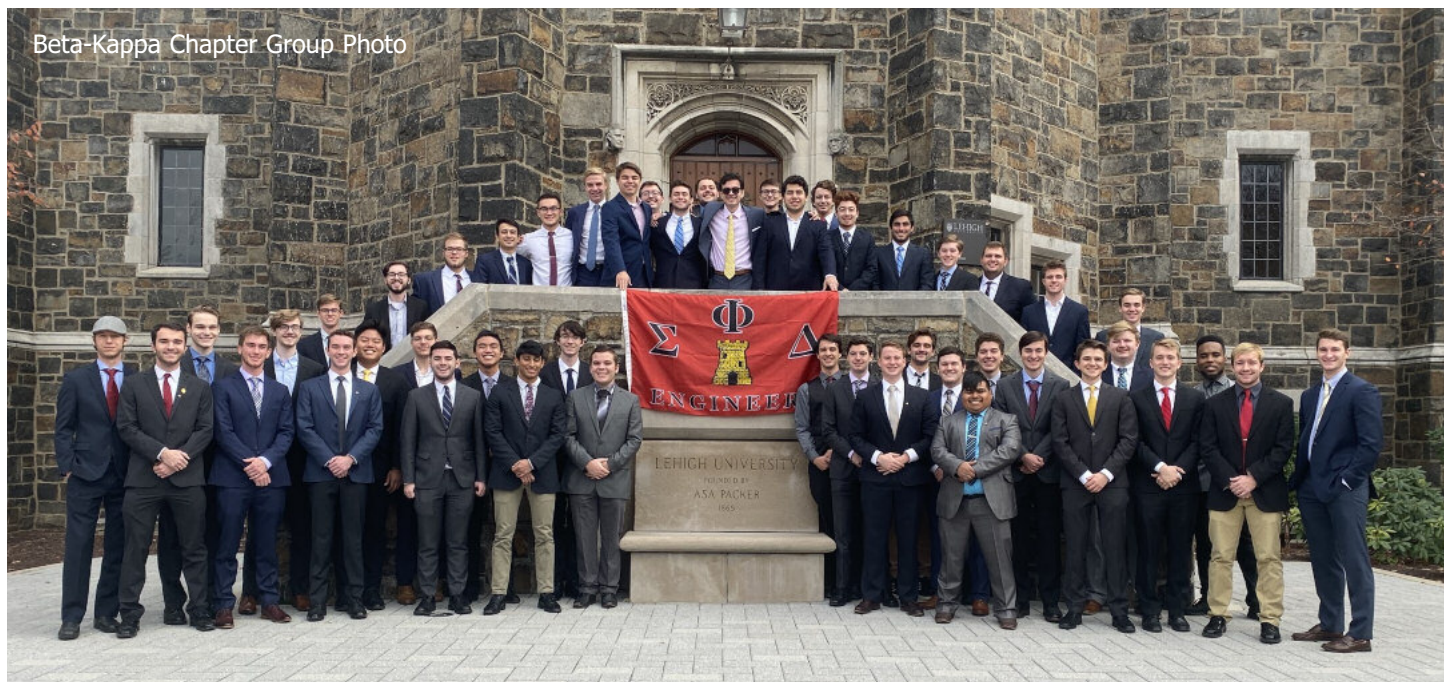
Beta-Kappa Chapter Group Photo

ed into Tau Beta Pi Engineering Honor Society. As a chapter, we raised nearly $5,000 for the Children's Hospital of Philadelphia during Hawkathon, Lehigh's twenty-four-hour dance marathon. We are proud to have been the highest