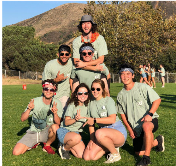
Beta-Nu Group Photo

Chapter funds continued to be an issue during