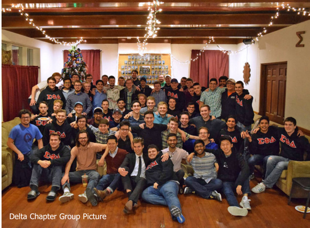
Delta Chapter Group Picture

Our social chairmen regularly organizes brotherhood events throughout the semester which are meant to foster closer bonds between Brothers. It's a chance to hang out with Brothers who you may not see on a regular basis through classes or otherwise. These range paintball outings to LAN parties at the chapter house. As a senior who doesn't live in the chapter house, I find these events valuable in that it gives me a chance to catch up with younger Brothers, share stories, and generally create a bond that will last after I graduate. I want to be able to come back for Homecoming as an alumnus and immediately be able to jump back into a conversation with an active. Even though Thanksgiving never started out as an organized brotherhood event, it has quickly become one of the most important brotherhood events of the year. It is usually held on the Saturday before Thanksgiving, and the chapter house kitchen is rife with activity in the morning as Brothers rush to cook their dishes