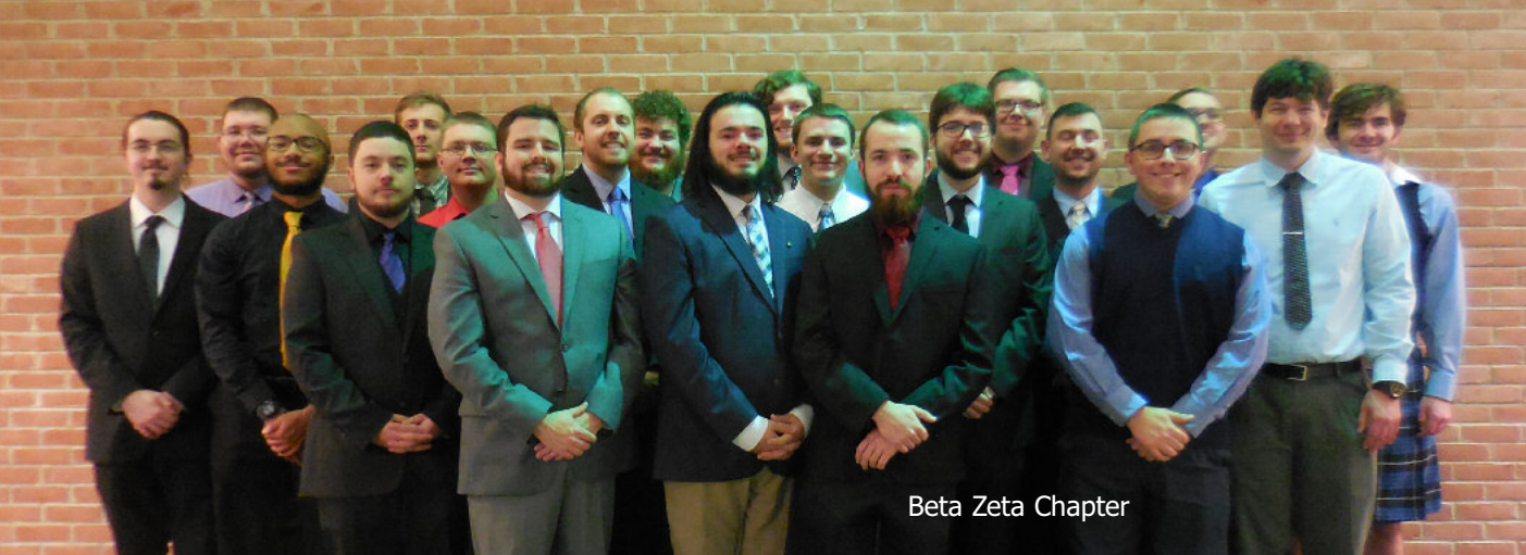
Beta Zeta Chapter