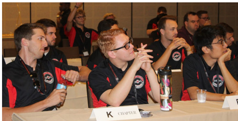
Learning about Chapter Spot Website

Trustees and Foundation also occurred during the convention. All the election results, minutes, and stat code changes will be forthcoming.