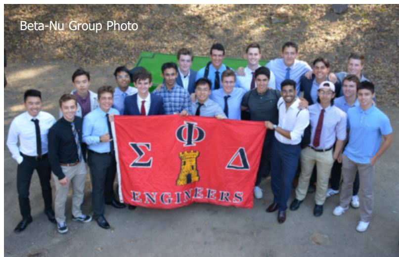
Beta-Nu Group Photo

Our chapter put on a variety of events this quarter. Brothers enjoyed a successful Alumni Weekend, during which many of our Alumni returned to visit the chapter, meet old friends, and connect with new members. We also arranged a