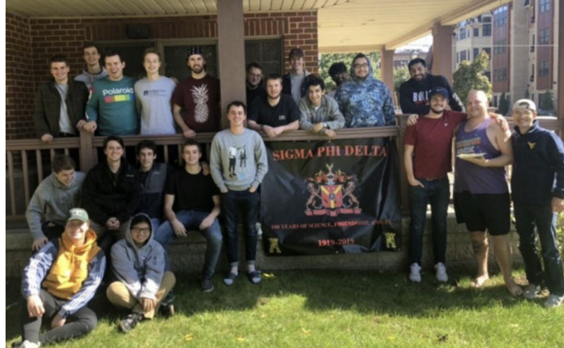
Eta Chapter - Beta-Xi visit

Over the weekend of September 27th, Eta chapter hosted several active members from Sigma Phi Delta's Beta-Xi chapter of West Virginia