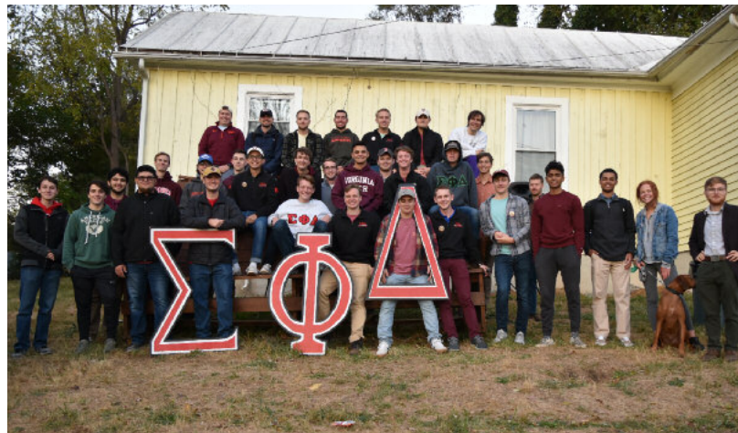
Beta Delta Philanthropy Group Picture

This semester also marked the launch of our new philanthropy, "Cookout for the Community." We raised over $1700 for a local non-profit that helps impoverished families in communities around Virginia Tech. In addition, we participated in the philanthropies of two other great organizations. It