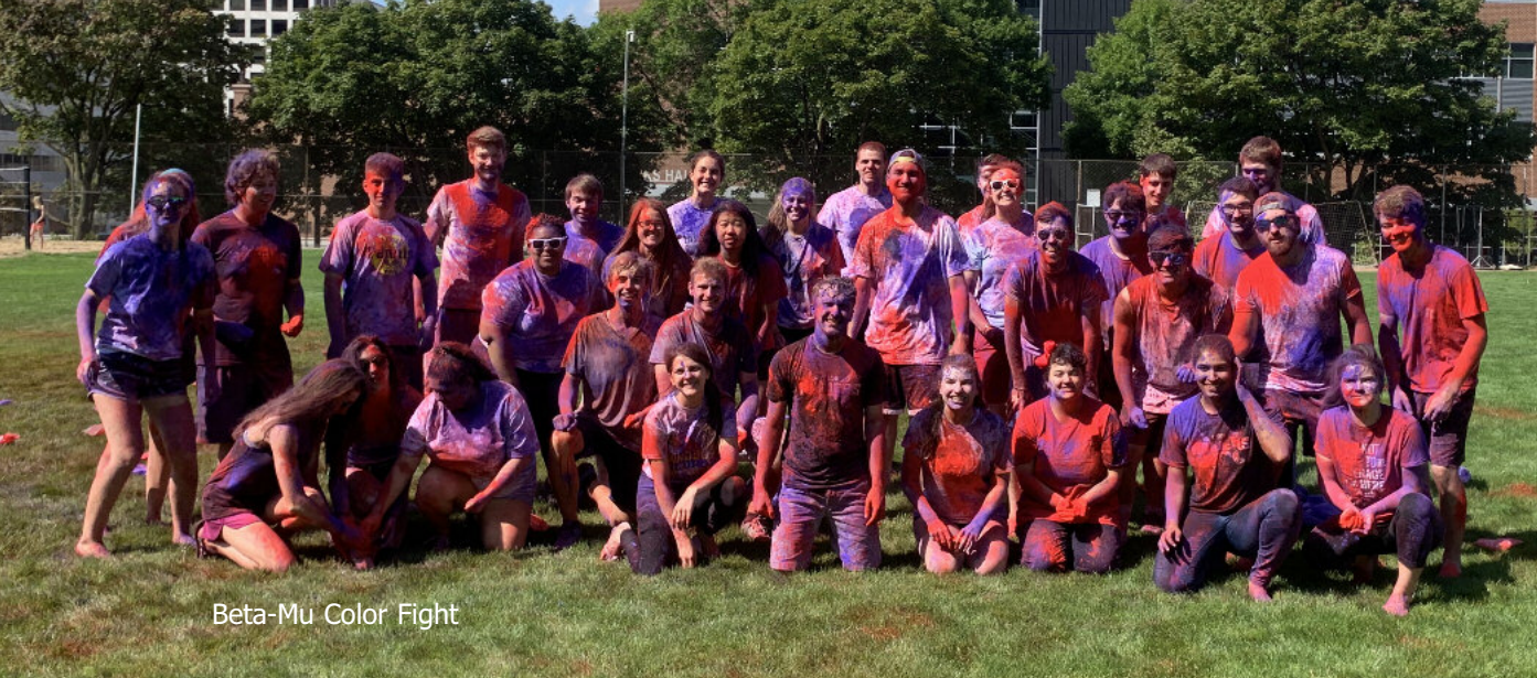
Beta-Mu Color Fight

in the fall, we planned and ran our annual color fight with a local sorority on campus, Kappa Sigma Mu. We had tons of fun putting it on as well as participating in it. In addition to promoting Sigma Phi Delta on campus it also helped promote the school as it was a major part of the Welcome Week promotional video for the Milwaukee School of Engineering. Of course, during baseball season Brewer's games are tons of fun to go to so we continued to go as one of our most popular rush events. Then throughout the semester, we had some visits from our friends at Kappa chapter as well as got together with Eta and some guys visiting all the way from Beta-Xi! We are all looking forward to the future and all the great things in store for us!