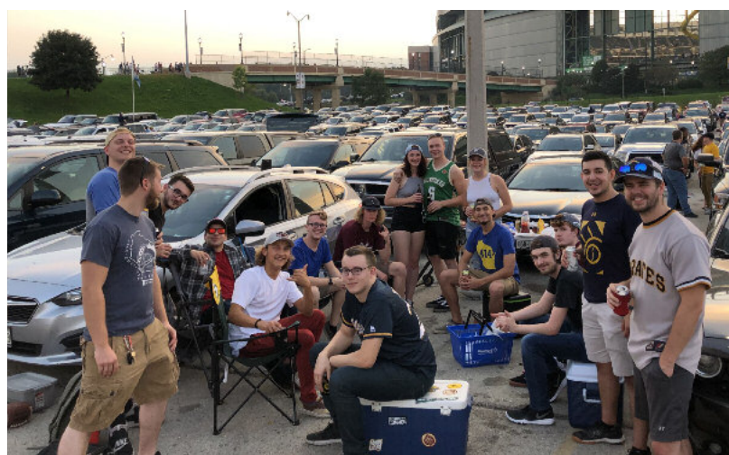
Beta-Mu at a Brewer's Game