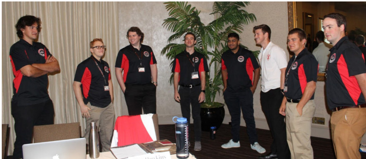
Brothers breaking out into a group activity