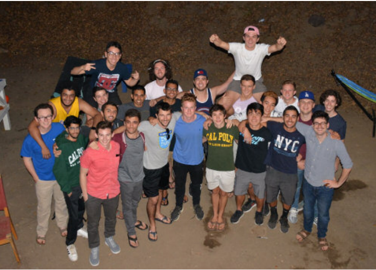
Beta-Nu Group Photo

Halloween Social in conjunction with our university's chapter of Alpha Omega Epsilon, with activities such as pumpkin carving and a costume contest.